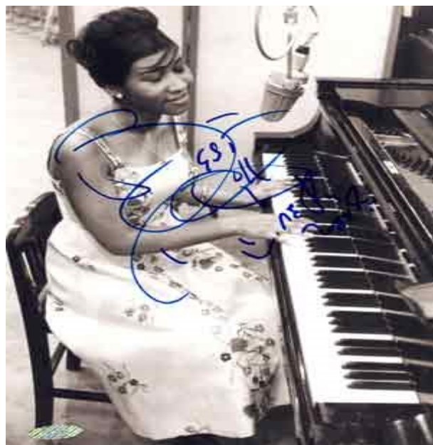
Aretha Franklin Autographed Display