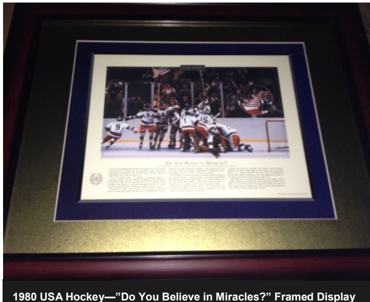
1980 USA Hockey—"Do You Believe in Miracles?" Framed Display