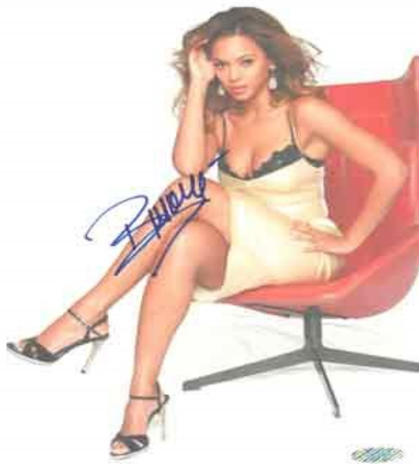
Beyoncé Autographed Framed Display