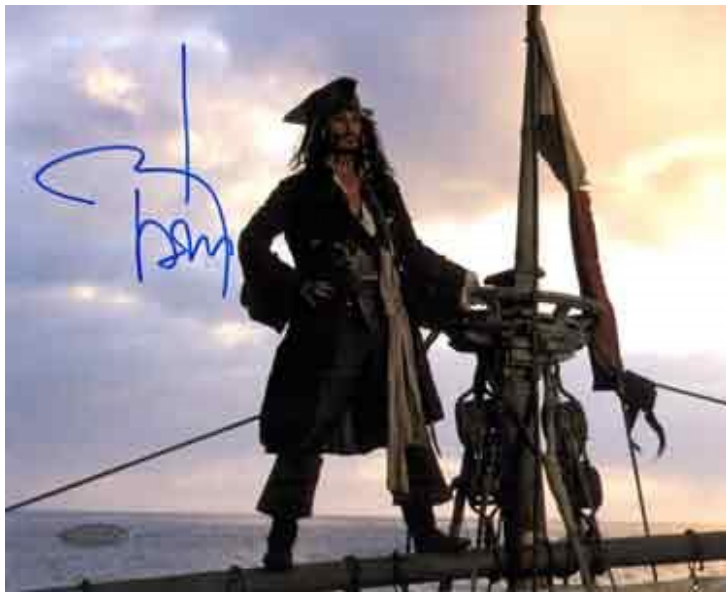
Johnny Depp Autographed Framed Display