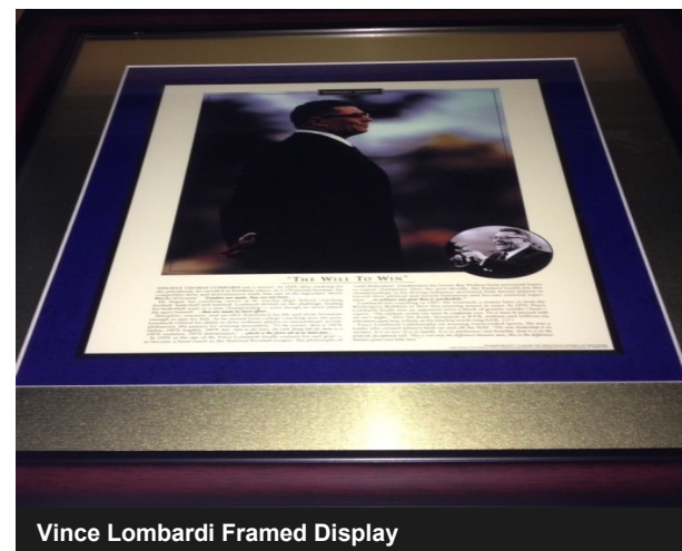
Vince Lombardi Framed Display